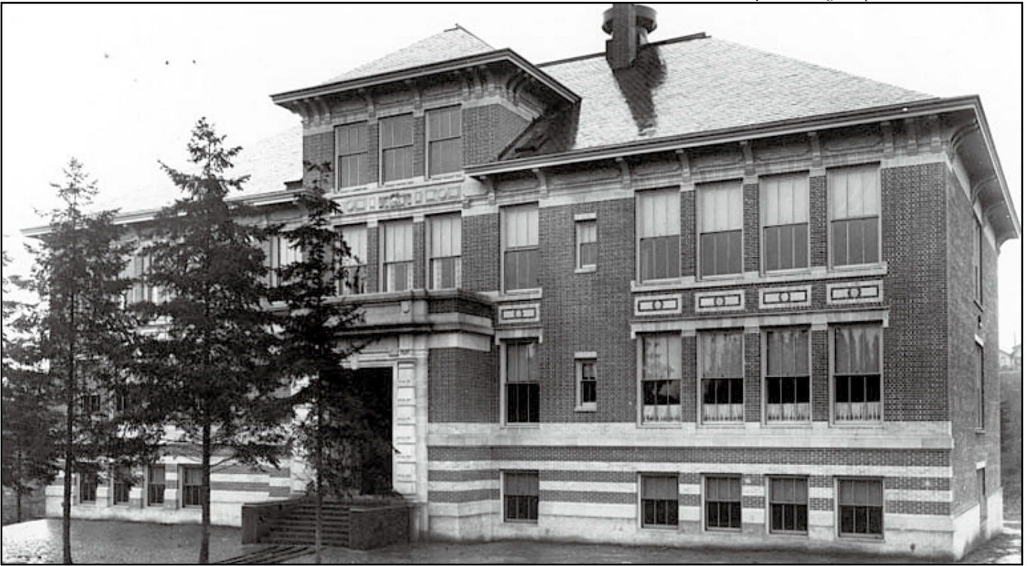
Figure 9. Ravenna School (Edgar Blair, 1911)